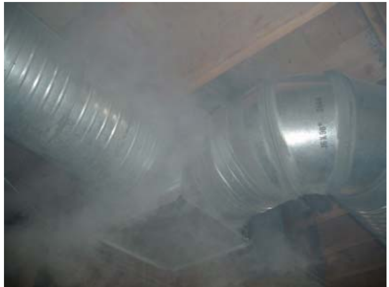
A smoke test is often helpful in locating leaks in the duct work.

The installing contractor must perform a duct pressurization test on each of his jobs (or hire someone to perform the test). There is no certification required for the contractor’s duct leakage test (the contractor must, of course, be licensed as appropriate by the Contractor’s State License Board). Over the next several months, the utilities and other groups will be providing opportunities for contractors to attend hands-on duct testing training classes. Training information is provided below but watch your industry publications and supply house notices for additional training.